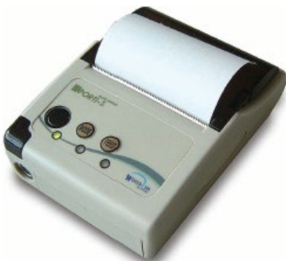
037.703 Thermal Printer with IrDA