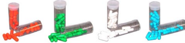
BUFFER TABLETS (pH 4-7-9-10)