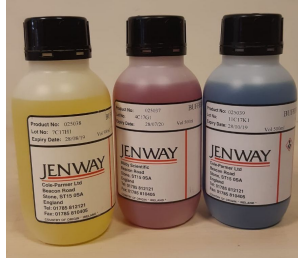
BUFFER SOLUTIONS (pH 2-4-7-9.22-10)