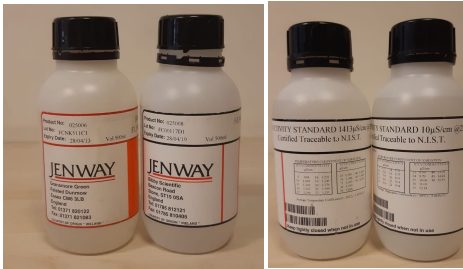
JENWAY Conductivity(EC) Standards 10µS/cm , 84µS/cm , 1413µS/cm , 12.88mS/cm