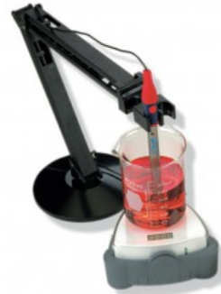
PROSENSE QA854X Swing-Arm Electrode Holder