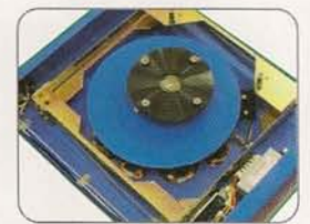
Plate type Brushless DC MOTOR provides low noise, no vibration.